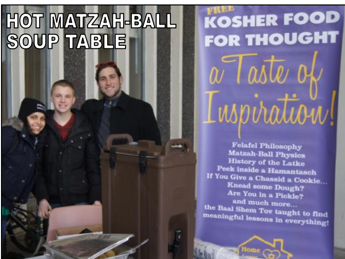
HOT MATZAH-BALL SOUP TABLE