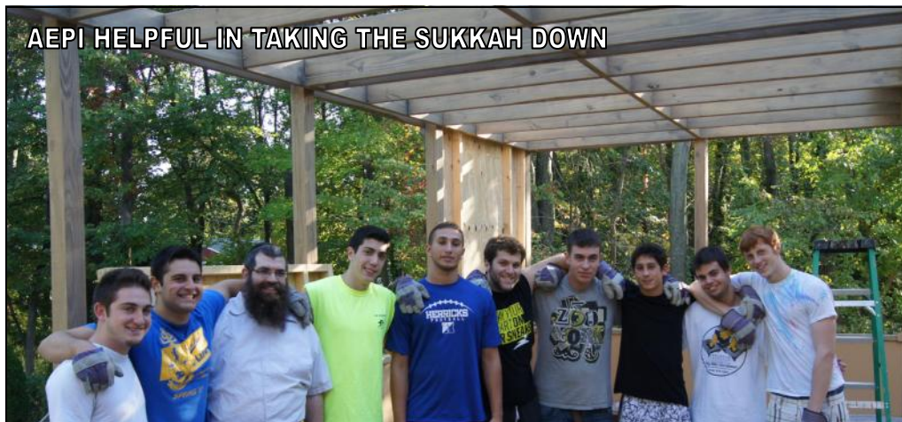
AEPI HELPFUL IN TAKING THE SUKKAH DOWN