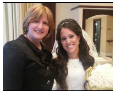
ALUMNI SIMCHAS & VISITS