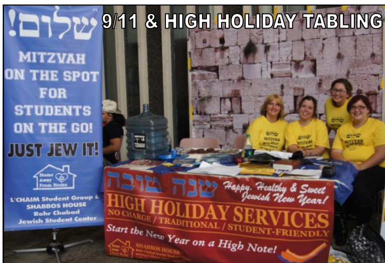
9/11 & HIGH HOLIDAY TABLING