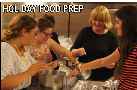
HOLIDAY FOOD PREP