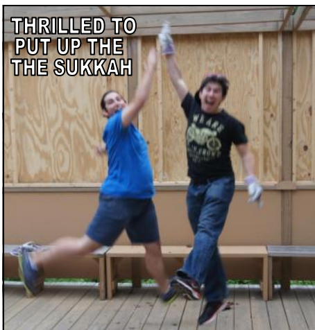
THRILLED TO PUT UP THE THE SUKKAH