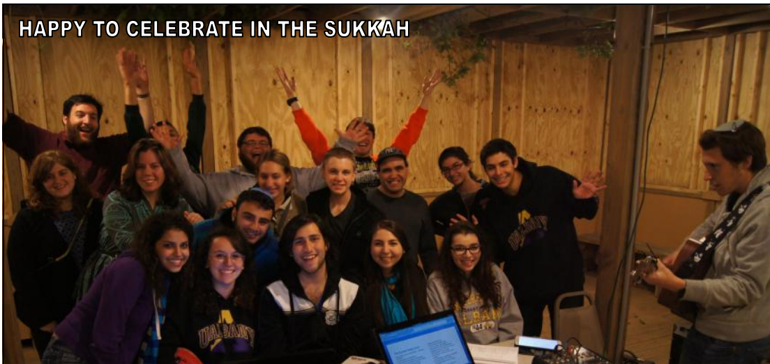
HAPPY TO CELEBRATE IN THE SUKKAH