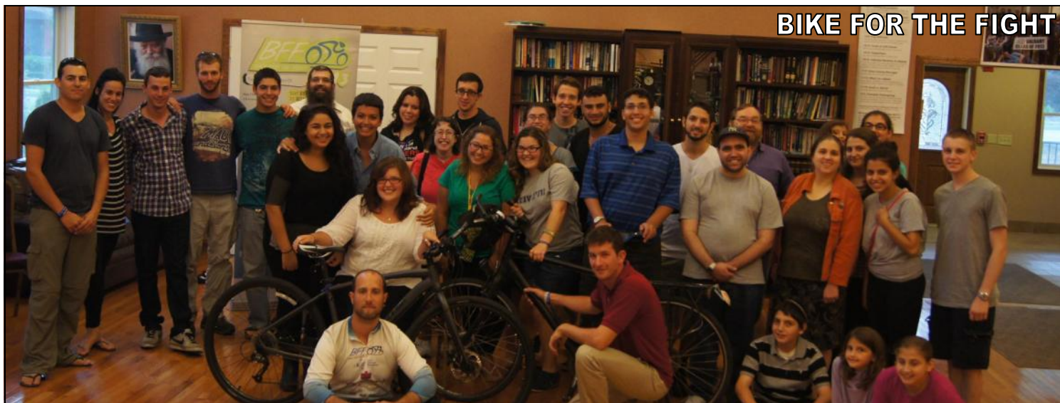
BIKE FOR THE FIGHT