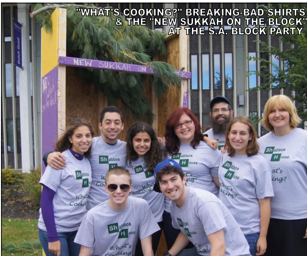
"WHAT'S COOKING?" BREAKING-BAD SHIRTS & THE "NEW SUKKAH ON THE BLOCK" AT THE S.A. BLOCK PARTY