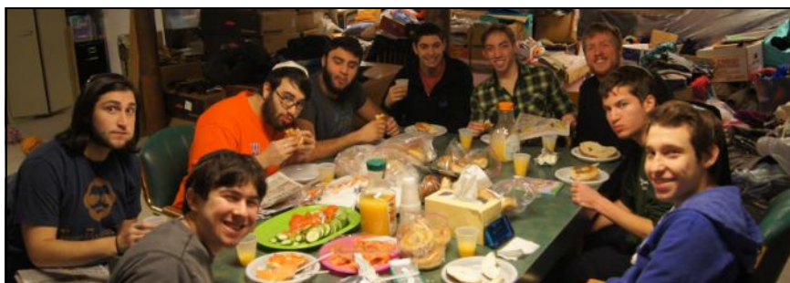
SUNDAY MINYAN BAGEL BRUNCH