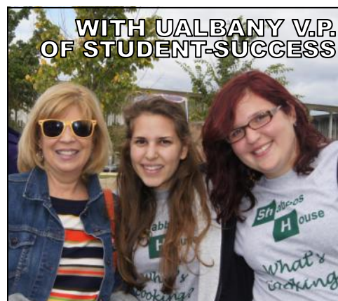
WITH UALBANY V.P. OF STUDENT-SUCCESS