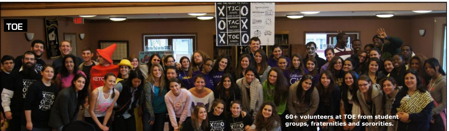
60+ volunteers at TOE from student groups, fraternities and sororities.