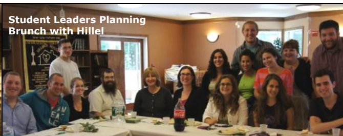
Student Leaders Planning Brunch with Hillel