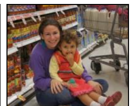
Behind-the-Scenes glimpses of L'chaim's new Unite Video. Ketchup-Man returns!