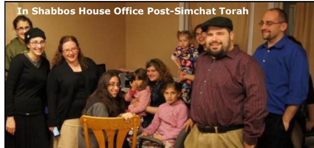
In Shabbos House Office Post-Simchat Torah