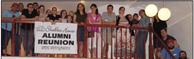
Annual Summer Alumni Reunion on 5th Ave in NYC