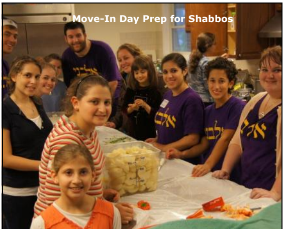
Move-In Day Prep for Shabbos