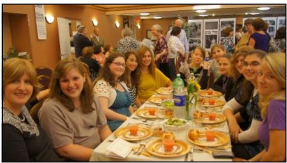
At a Sheva-Brachos