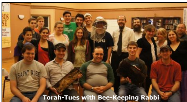
Torah-Tues with Bee-Keeping Rabbi