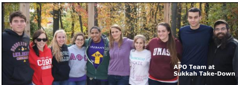
APO Team at Sukkah Take-Down