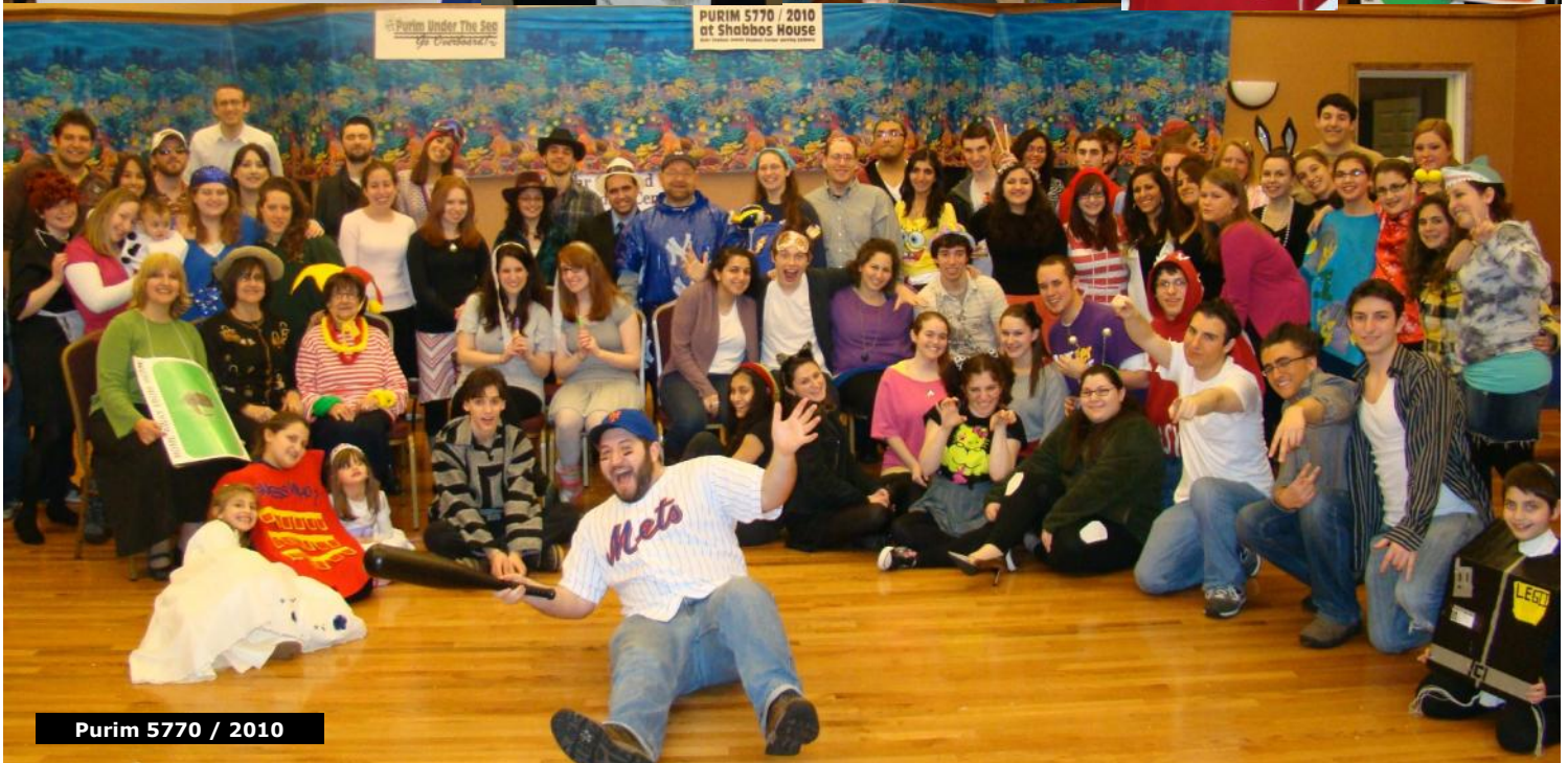
Purim 5770 / 2010