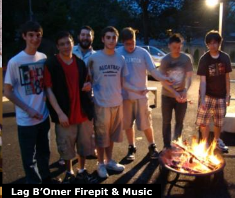
Lag B'Omer Firepit & Music