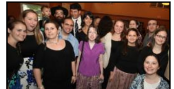
CHANI'S BAS MITZVAH