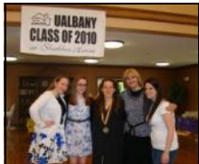
FAREWELL CLASS 2010