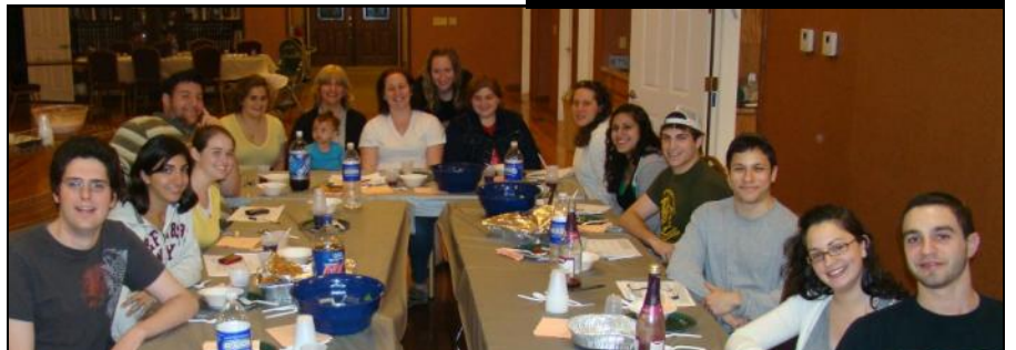
The L'chaim Student Board... for planning and implementing amazing events.