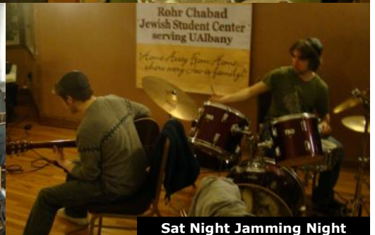
Sat Night Jamming Night