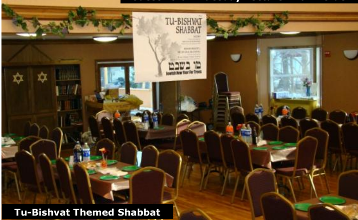
Tu-Bishvat Themed Shabbat