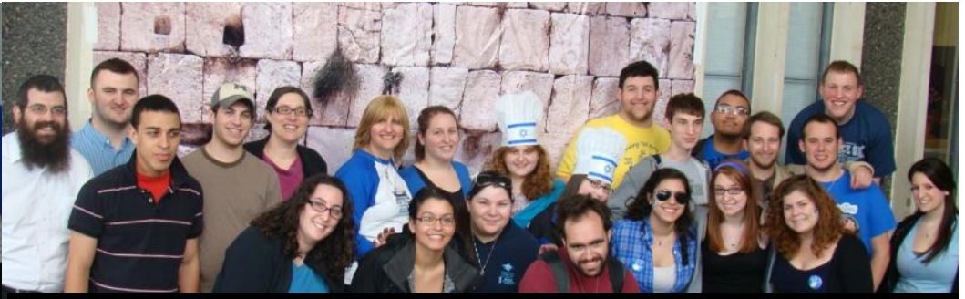
Israel Fair on Campus Center with "Jerusalem - World's (Spiritual) Cookie Jar!"