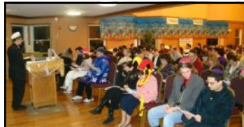
SPRING '10 SEMESTER HIGHLIGHTS