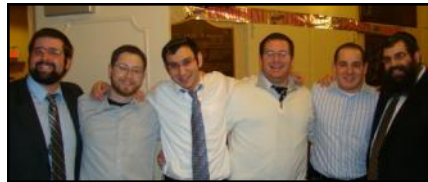
ALUMNI VISITS & SIMCHAS