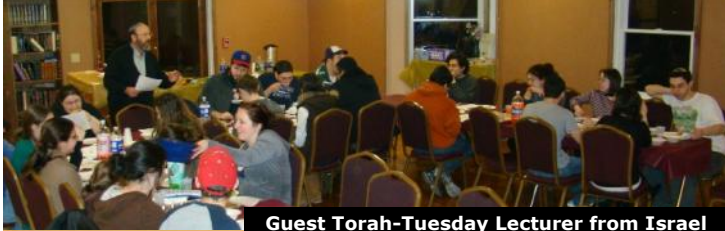
Guest Torah-Tuesday Lecturer from Israel