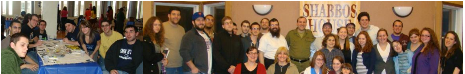
IDF Rabbi Speaker