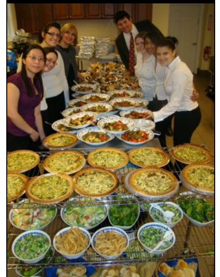
The Community Service Volunteers... who (in addition to all student volunteers) helped with prep & setup.