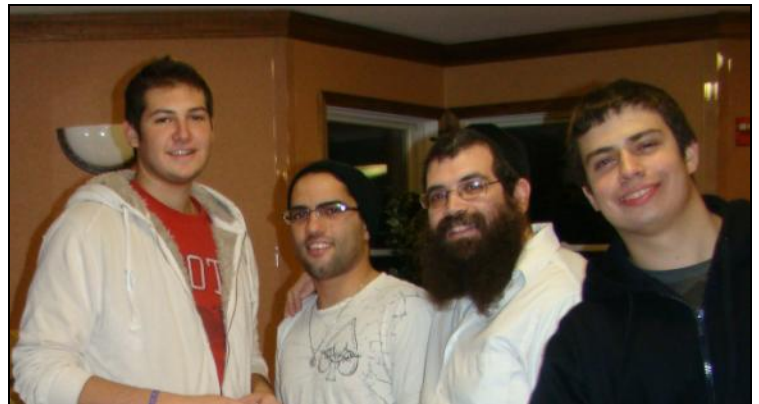
Great Neck Friends