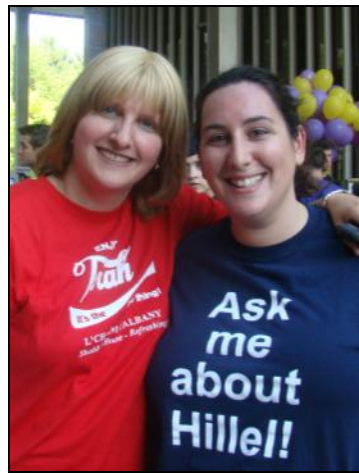
Chabad & Hillel Relationship