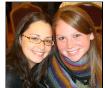
L'chaim Board members