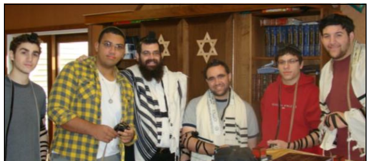
Minyan Bagel Brunch