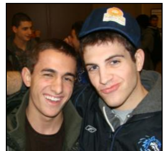
Coaching Pre-Donut Contest